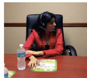
All Points Bulletin Radio show AM 1470 Sundays at 2:00pm

"It is not easy to be a pioneer -- but oh, it is fascinating! I would not trade one moment, even the worst moment, for all the riches in the world."