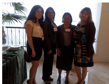
FIU AMWA Social: on Fischer Island, Miami Beach